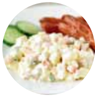
Kartulisalat (potato salad)