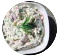
Heeringas hapukoore ja sibulatega (Herring with sour cream and onions)