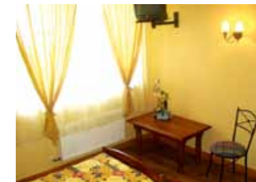
Sadama Villa Guesthouse