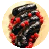
Verivorst (blood sausage)