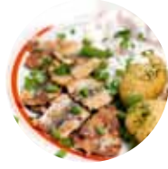
Seapraad mulgikapsaga (pork roast with sauerkraut)