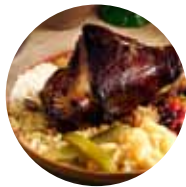
Mulgipuder (southern regional potato porridge)