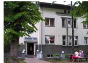
Sadama Villa Guesthouse

Students may rent private flats in the city for about 150-250 EUR/month (1-2 rooms). Apartment prices can be misleading in summer because prices are a lot higher in summer (rent can be up to 80 EUR/day). Contact the owner to enquire about the real price of the apartment.