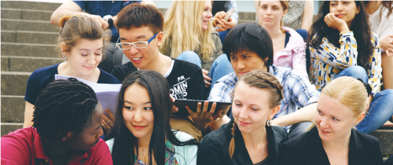
Young people from more than 80 nations study on our campus in Flensburg. Approximately 350 of the roundabout 5000 students have a foreign passport.