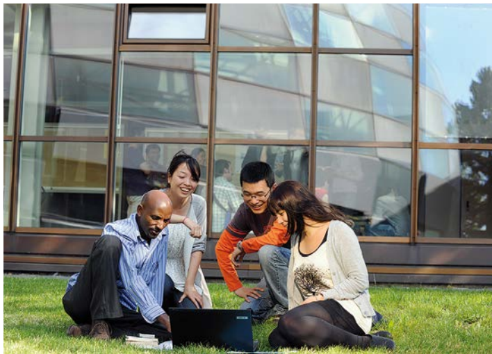
People from 130 countries come together at Freie Universität.

The foundation of Freie Universität Berlin was facilitated through international support, and international impulses have shaped its research and teaching ever since. In order to survive, both on an academic and an intellectual level, Freie Universität established connections from its geographically isolated position in West Berlin to organizations and personalities in Western Germany, Europe, and the world beyond. What began as a necessity rapidly evolved into a successful strategy: currently, Freie Universität has approximately 180 partnerships with scholarly institutions worldwide. The university is a drawing card for researchers from abroad. Freie Universität is the location in Germany most often selected for visiting scholars through the Alexander von Humboldt Foundation. A total of 30,600 students are enrolled in more than 180 subject areas. 16 percent of the students come from abroad, as do 26 percent of the doctoral students.