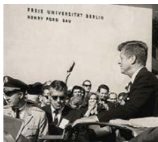
In 1963, U.S. President John F. Kennedy gave a programmatic speech at Freie Universität.

Freie Universität Berlin was founded by students and scholars on December 4, 1948, with the support of the American Allies and Berlin politicians as a response to the persecution of students critical of the system at Universität Unter den Linden in the Soviet sector of the divided city of Berlin. These students and scholars wanted to study and carry out research at Freie Universität, free of political influence. Thanks to generous donations from the United States, Freie Universität was able to construct several new central building complexes including the Benjamin Franklin university hospital complex and the Henry Ford Building, the central lecture building. Based on its founding tradition, Freie Universität's seal bears the Latin terms for truth , justice , and liberty . The university presents its Freedom Award to personalities who have made a special contribution toward the cause of freedom, among them the South African Archbishop Desmond Tutu, the former President of the Republic of Korea Kim Dae-jung, and the musician Daniel Barenboim.