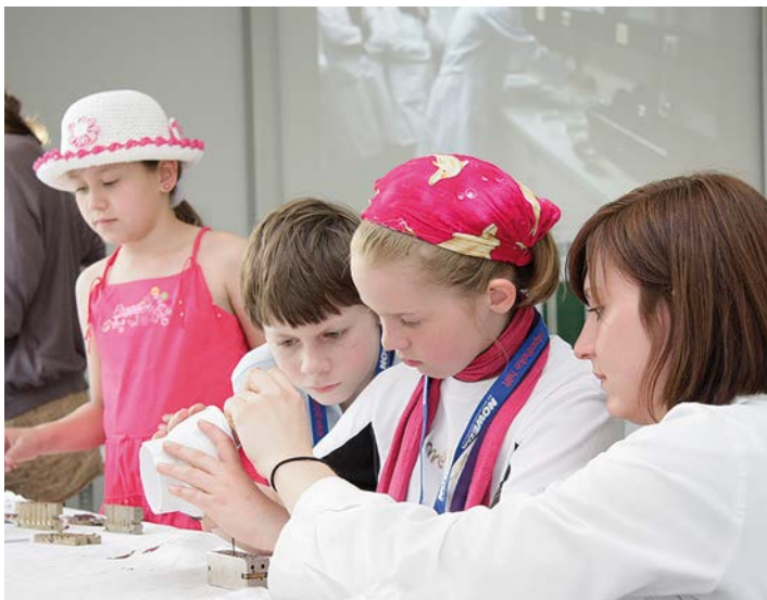
During the Long Night of the Sciences, Freie Universität Berlin has a special program for children.

Researchers at Freie Universität Berlin regularly open their institutes, laboratories, and libraries to the public, for example, during the Long Night of the Sciences or open house days. The Center for Cooperation with Schools organizes various activities open to schoolchildren. These include a children's university and a summer school with many activities in the special labs for schoolchildren, NatLab and PhysLab. Many lectures on a variety of topics, as well as courses in the Guest Card Program are open to the public. The university confers honorary doctorates on outstanding personalities from Germany and abroad: these include the former UN Secretary General Kofi Annan; the Nobel Prize winners in Literature, Orhan Pamuk and Imre Kertész as well as the author Salman Rushdie.