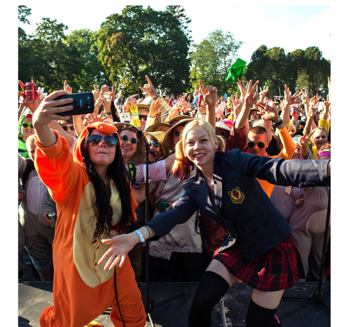
Student Union TUO arranges every autumn a freshmen party called Keltanokkabileet (KNB) for TUAS' new students. In 2014 the party theme was comics and all the participants were dressed to the theme. This year the party will be held at 8 September. Photo: Sampo Pihlaja.2014.

In Messi (Studying > UAS legislation and degree regulations) you can find the degree regulations, which contain the most important policies on what you can do in terms of the studies. The degree regulations contain information on e.g. accreditation of studies and competence, improving your grades and the evaluation of courses etc.