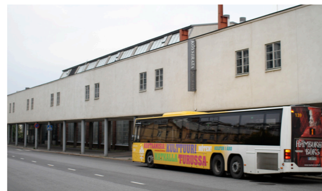
The Arts Academy premises in Linnankatu is where studies in fine arts, music and performing arts take place. The peculiar building is a former rope factory.