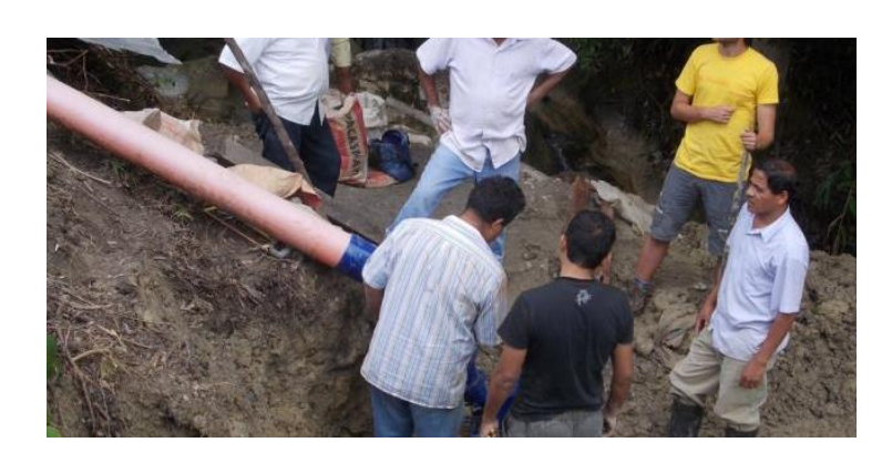
Humasol project in Peru